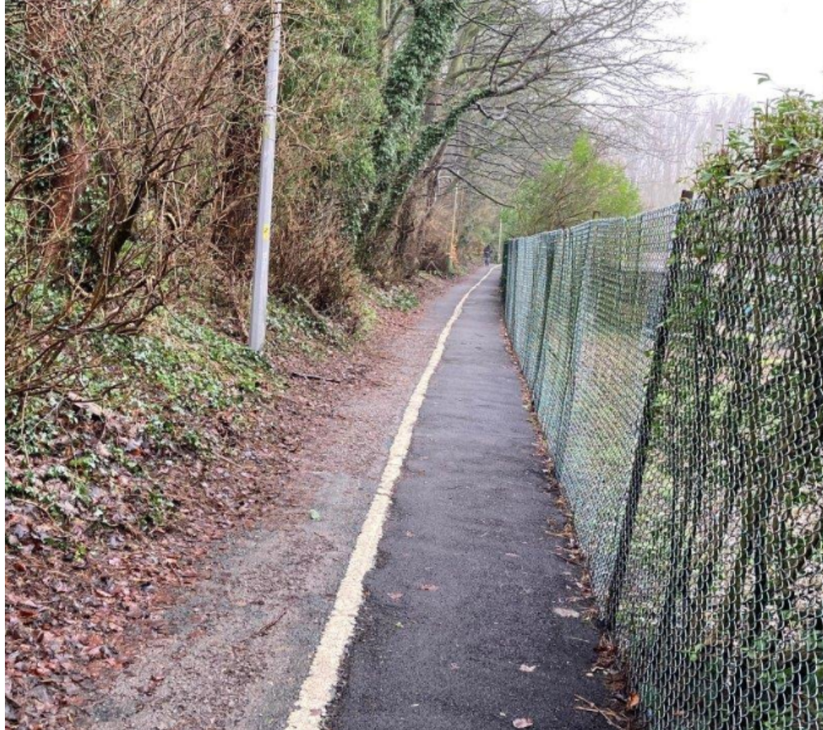
Golden Way footpath