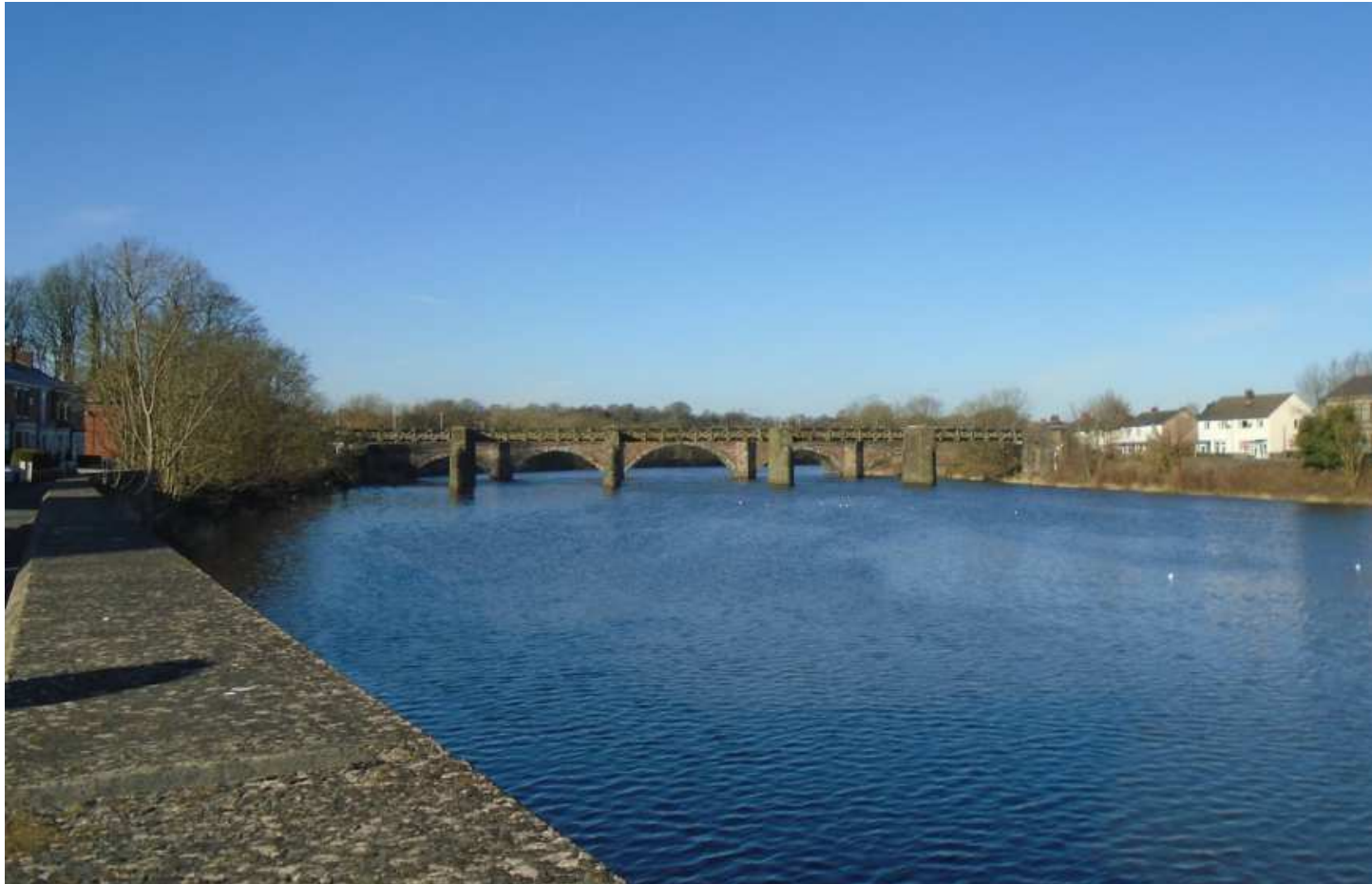
Riverside Road looking towards the gas pipe bridge and Penwortham Old Bridge