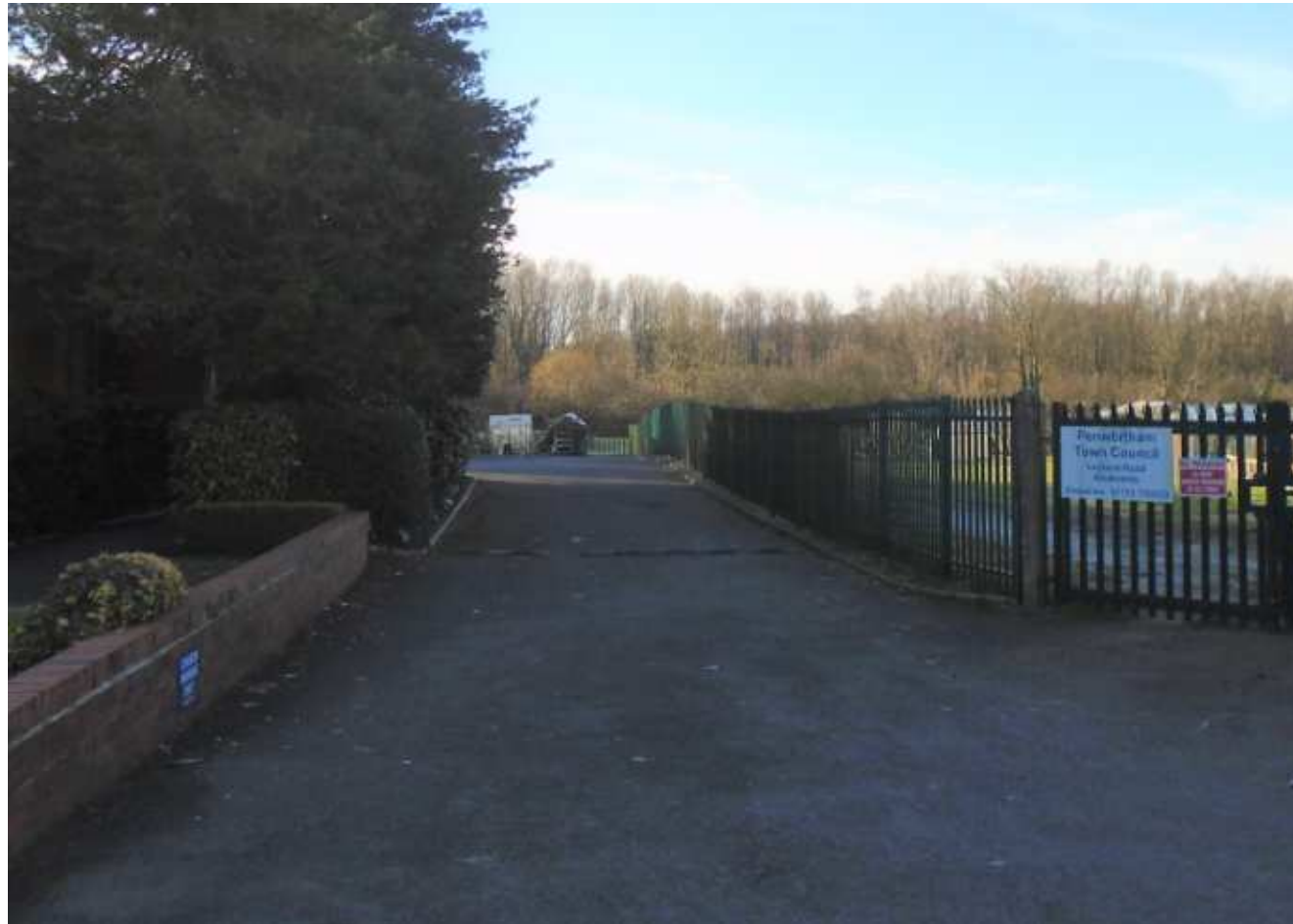
Penwortham Allotments off Leyland Road