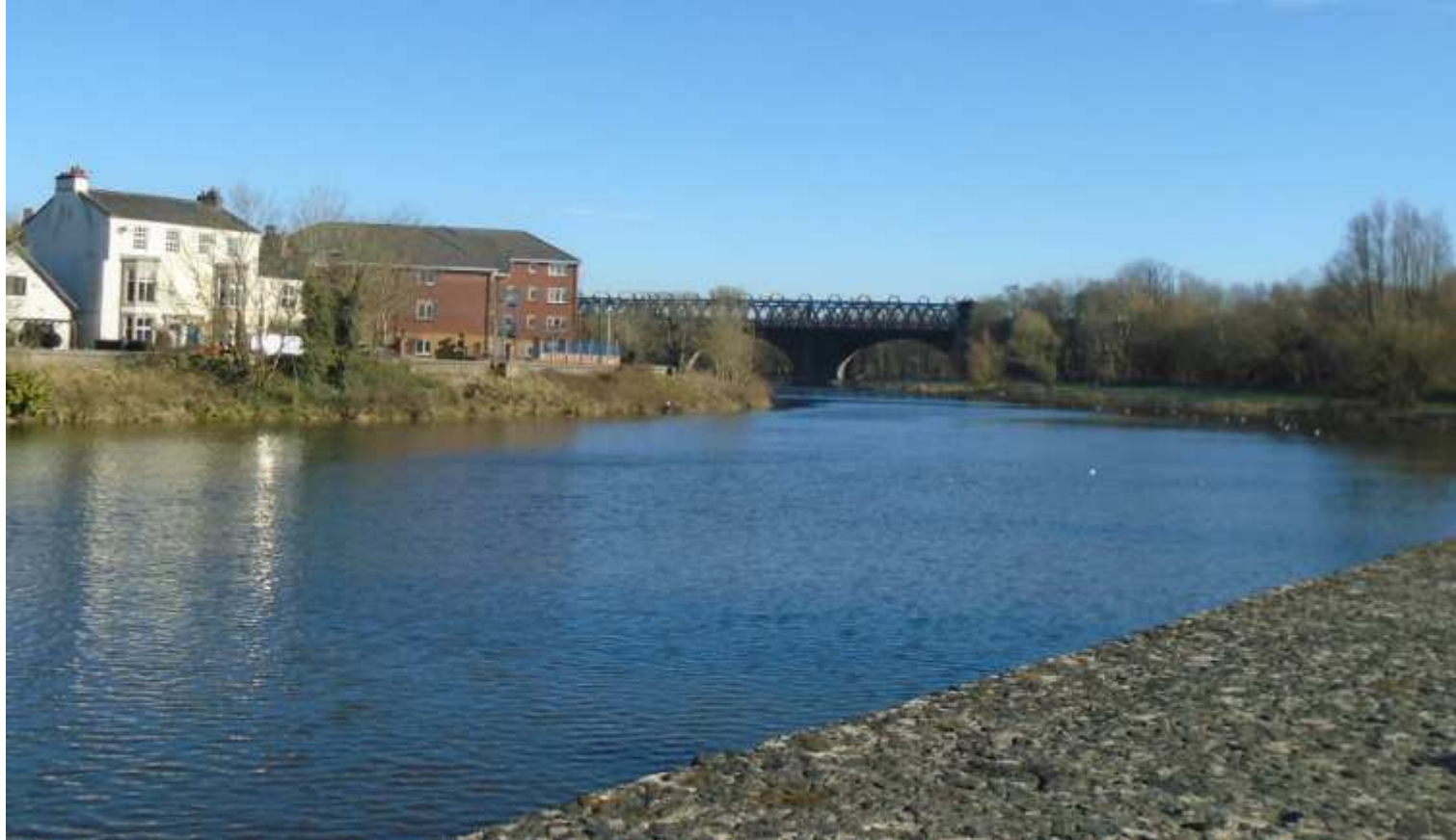
Riverside Road looking towards Riverside