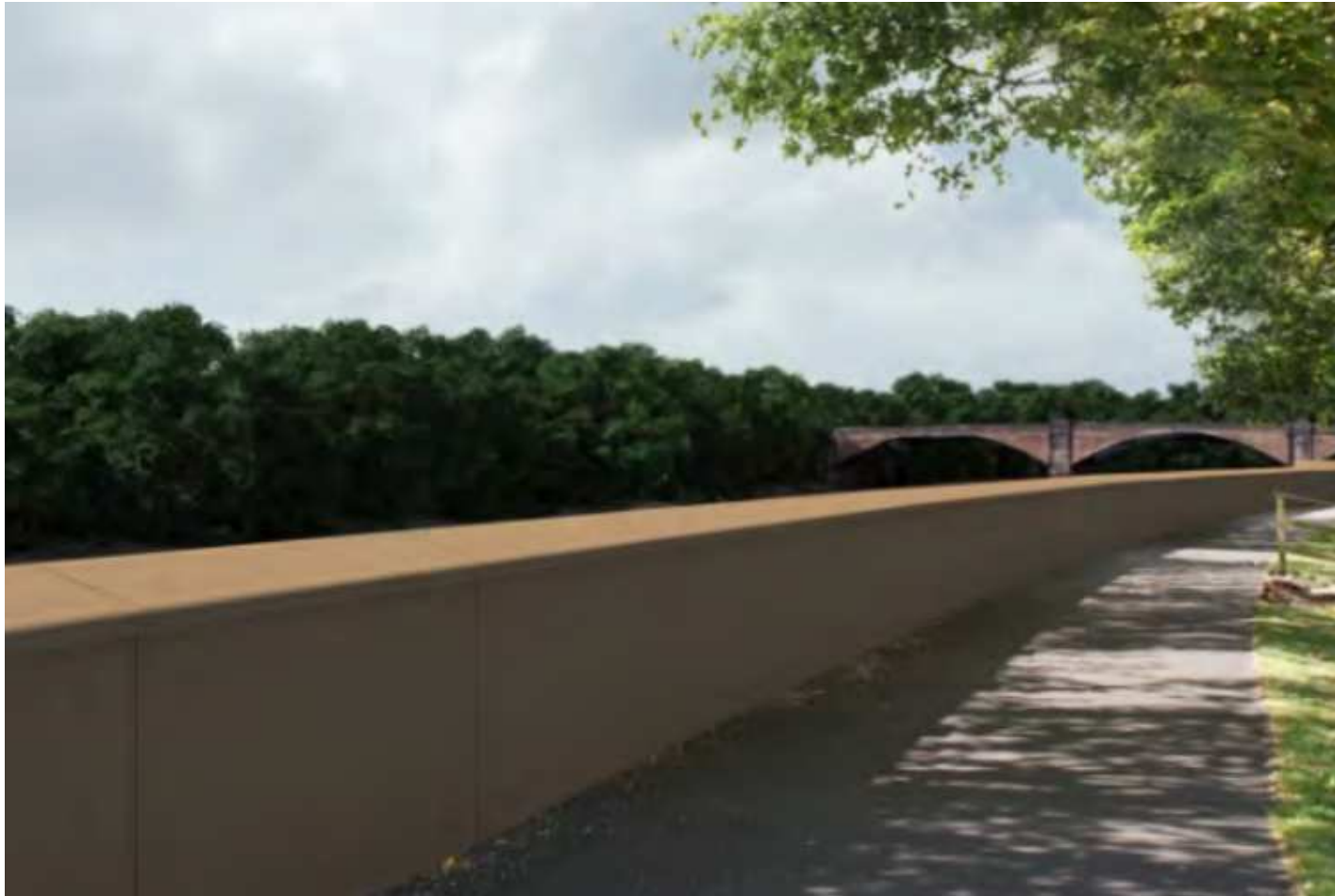
Visualisation of the concrete flood wall