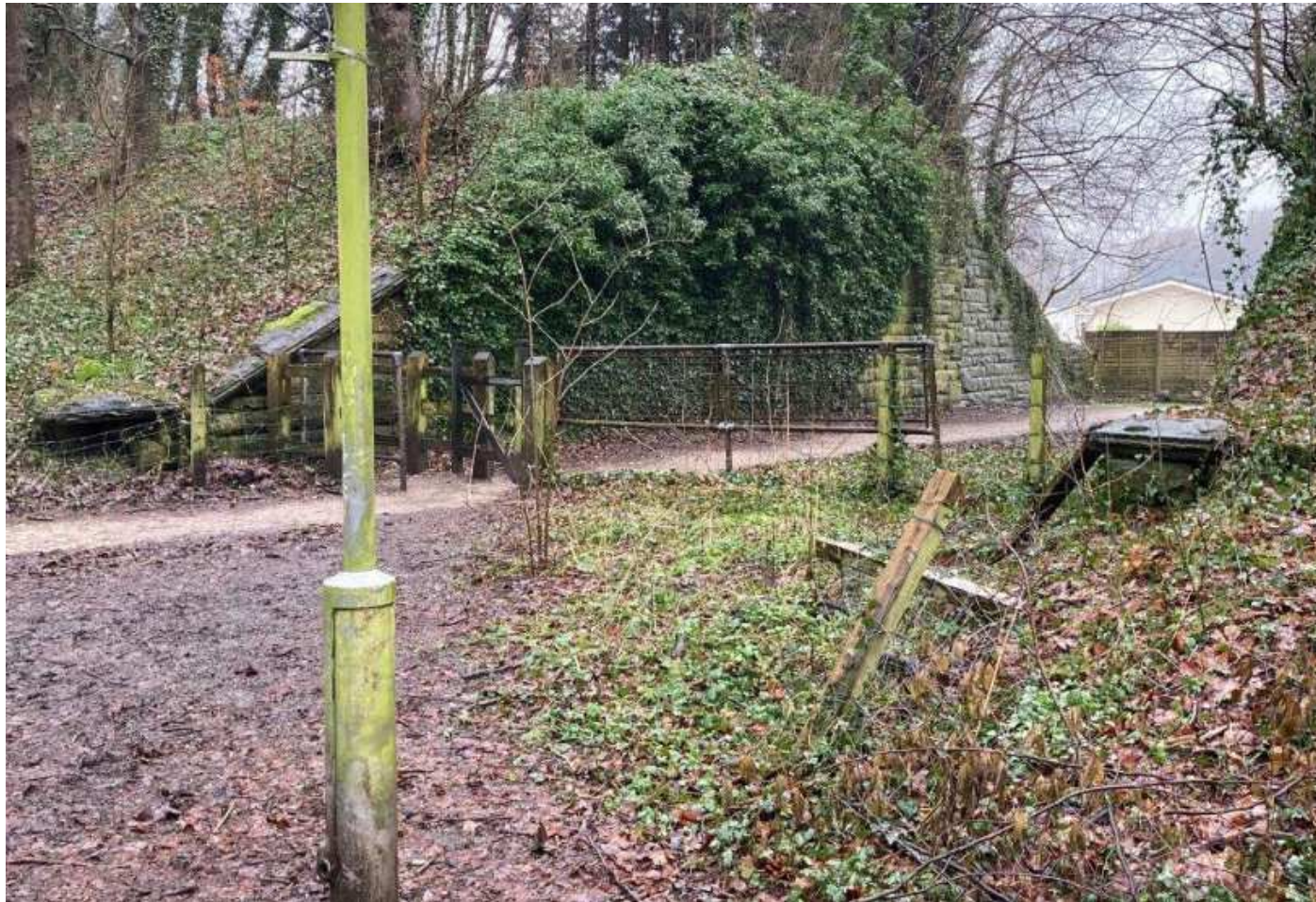
Former railway embankment cut through