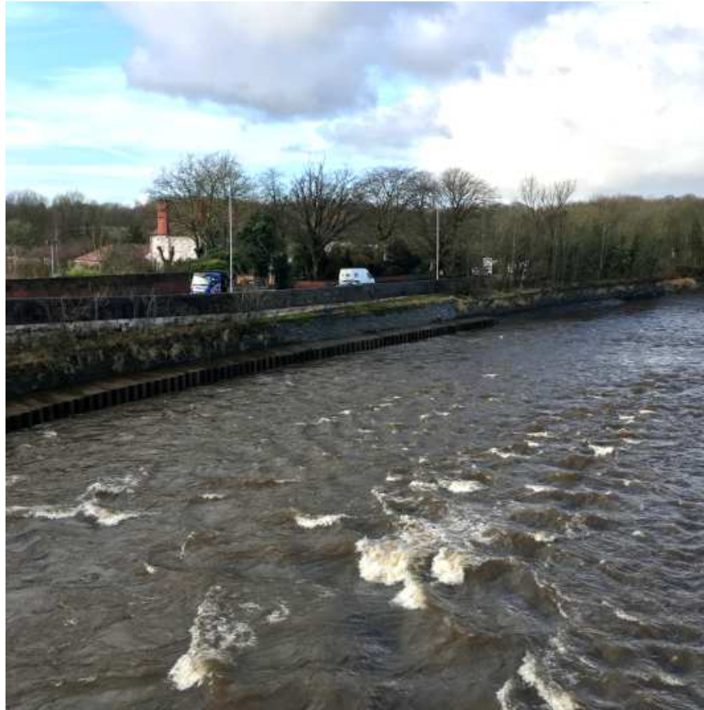
Leyland Road downstream of Penwortham Old Bridge